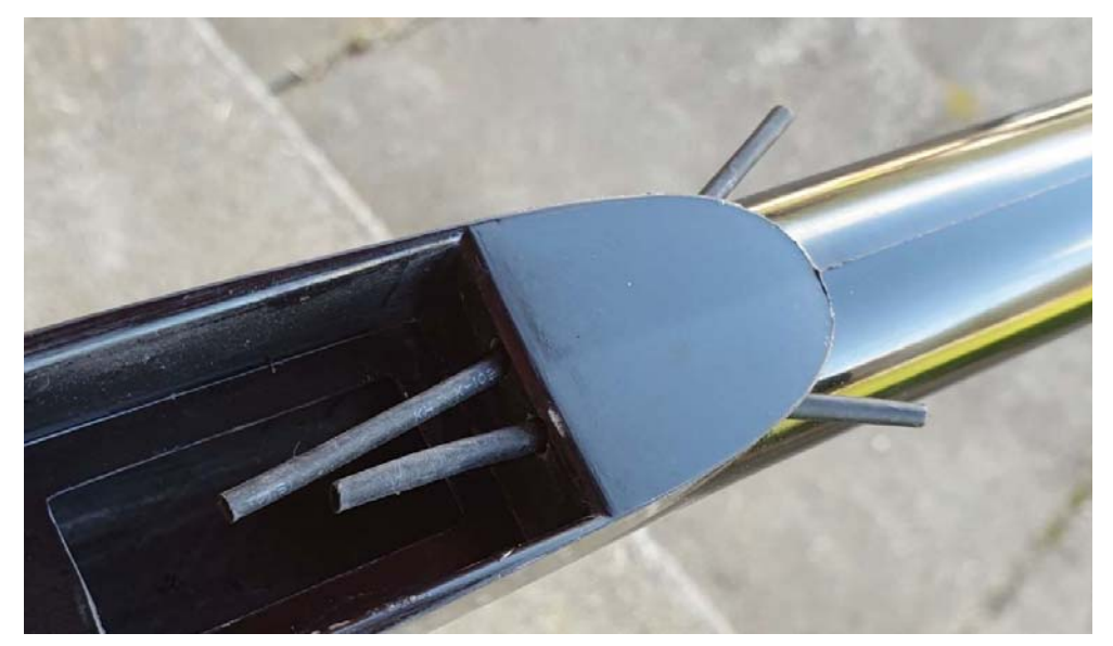
Antenna holes / guidance tubes