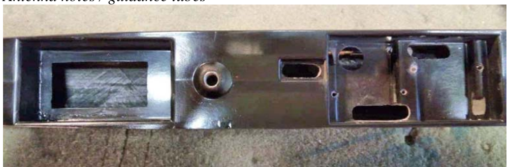
Cutting holes in fuse before assembly