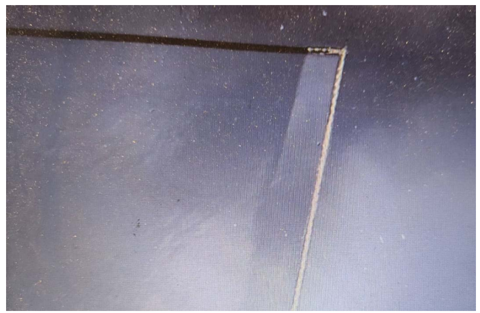
Damage to hingeline after too much movement (above 90 degrees) or flaps touching ground on landing