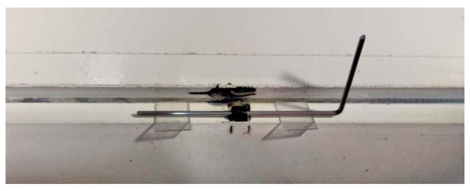
Distance aileron to pin is 0,5mm