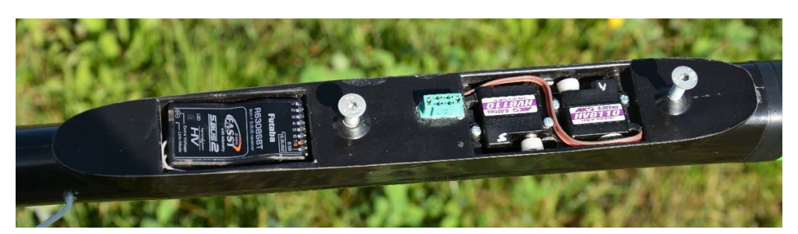
Servos and receiver installed in fuse

Mount elevator and rudder and secure in neutral with some tape. Shorten the rod for correct length by marking the total length to servo horn with a pen and then pull forward thru opening for cutting. The coupler can be glued to the carbon rod with Cyano and for safety pinch the coupler with a plier to ensure tight fit. Check the connection thoroughly