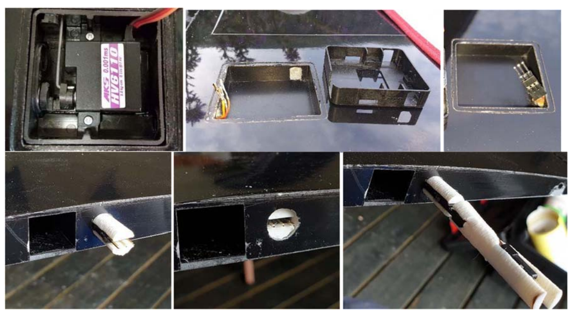
Aileron and flap servo details – below: Contact holder arrangement glued in Assembling the fuselage: