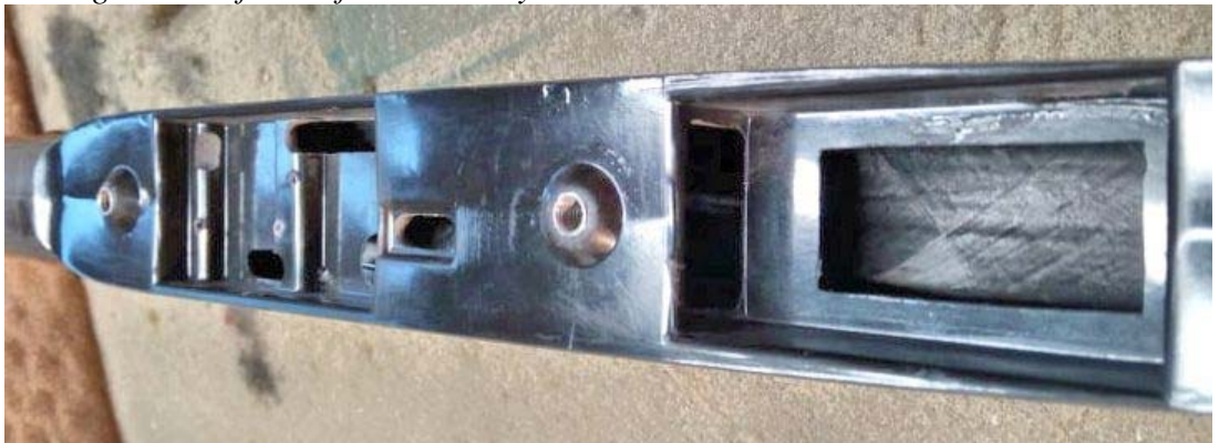
Cut in fuse for receiver wires